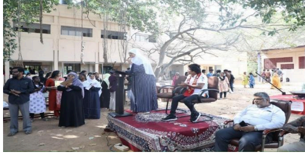
(Principal welcoming the gathering)