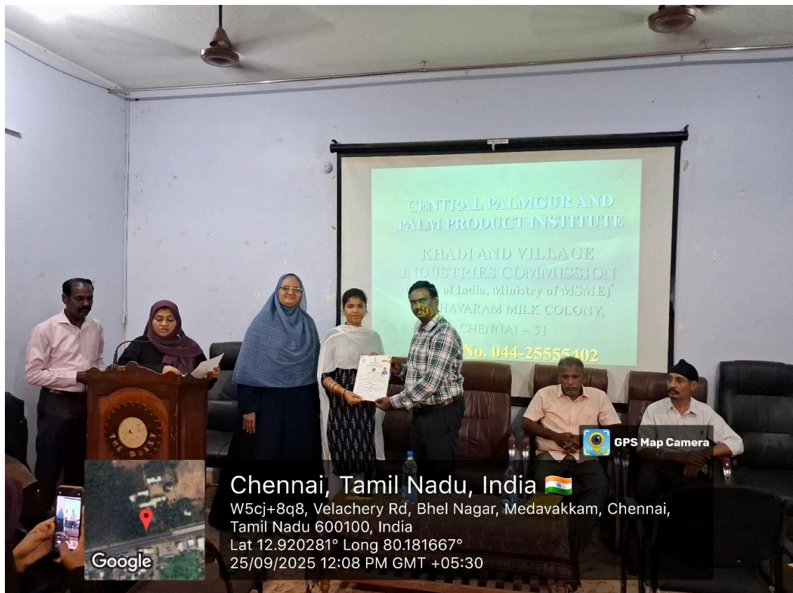
(Resource Person distributing certificates to students)