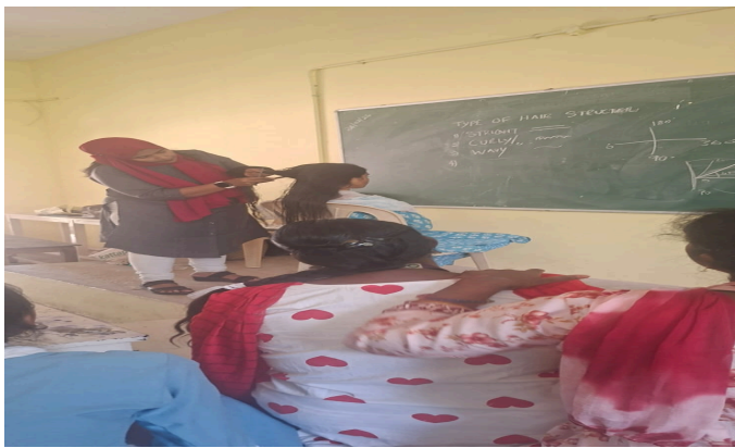
(Glimpses of Beautician Workshop)