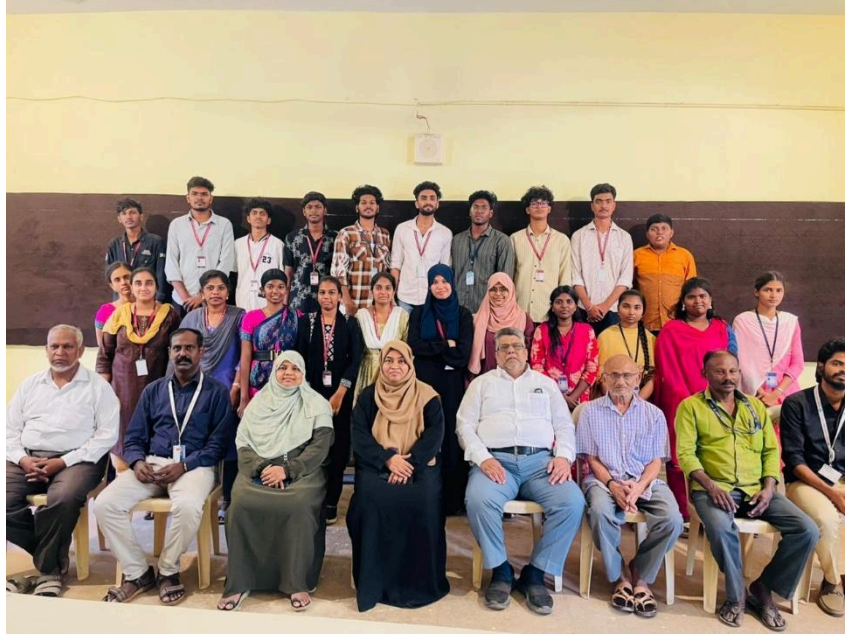
(Group Photo with Vice-Principal, Bakery Trainer, EDI Cell Members and the student participants @Bakery Workshop)