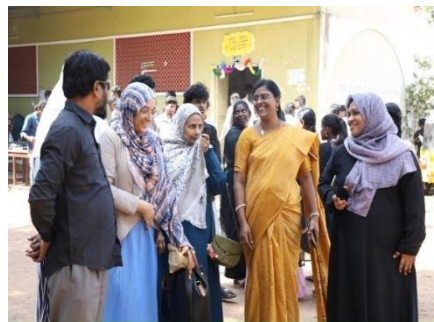
(Glimpses of ED Bazaar with guest, management family member, staff, parents and students)