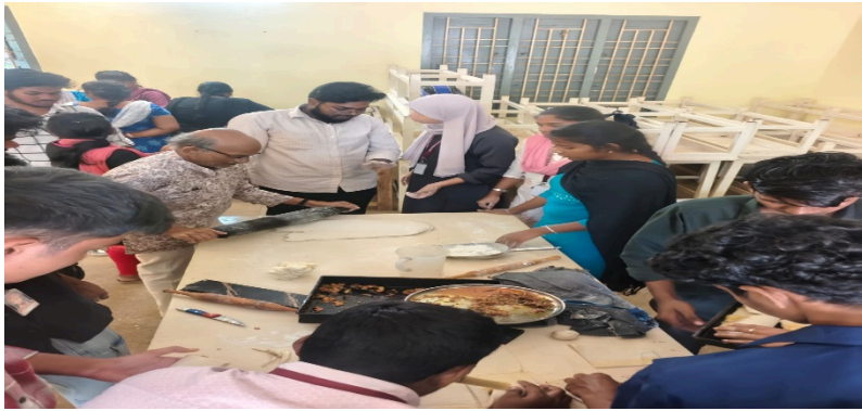
(Glimpses of Bakery Workshop)